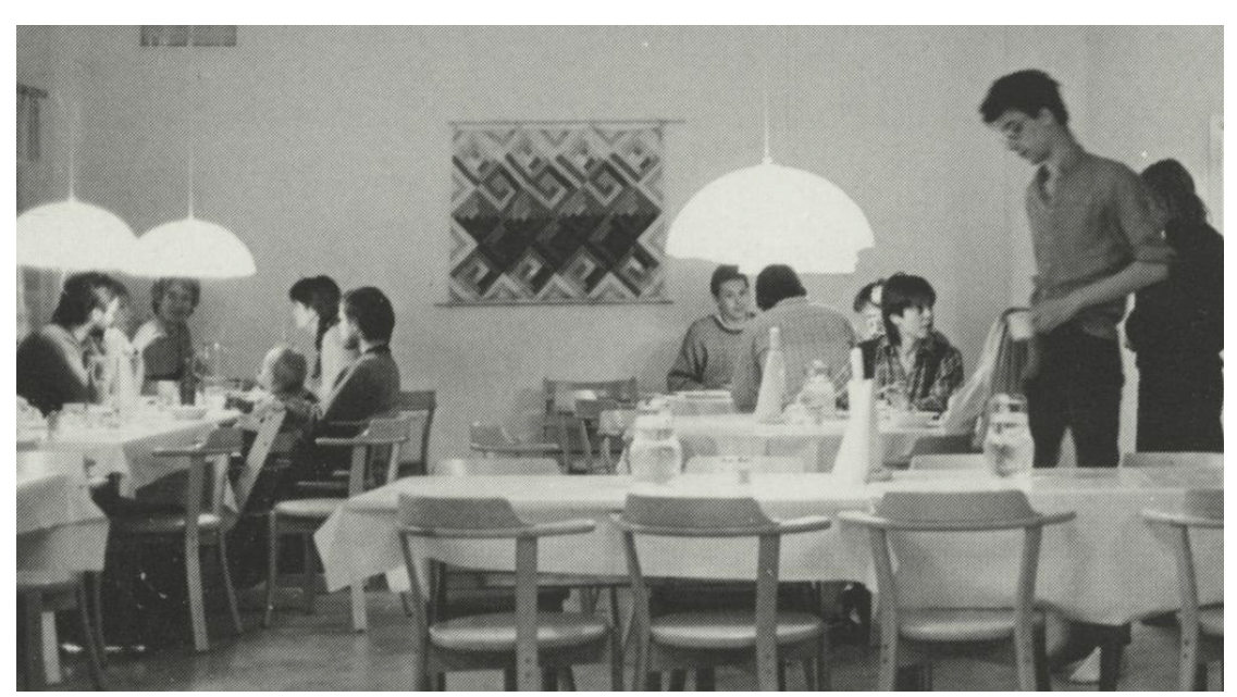
Dick Urban Vestbro,1997: "The communal dining room of the Prästgärdshagen unit, built in 1982-83. Tenants may sit down at set tables 10-15 days before it is their own turn to do the cooking. Inexpensive but healthy food dominates."

Personal knowledge is centered as the starting point: the semester will begin with an extended precedent and research study prompted by each student's own experience. We will work iteratively and carefully through architectural drawing and modeling, paying attention to the dual development of ideas and craft through representation and presentation. In the latter portion of the semester, students will develop individual projects with an interrelated social and spatial structure as a proposal for a non-normative model of domesticity.